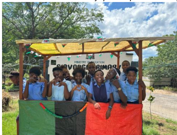
The shelter created with recycled plastic sacks